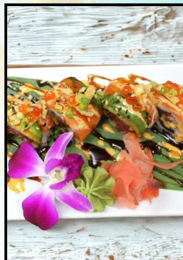
NEW Tigertail Roll

Traditional citrus lime marinated yellowtail, baby shrimp & scallops, tuna, salmon, octopus, cucumber, avocado, cherry tomatoes, cilantro, onion, mango and jalapenos. Served with crispy wontons OR tortilla chips.