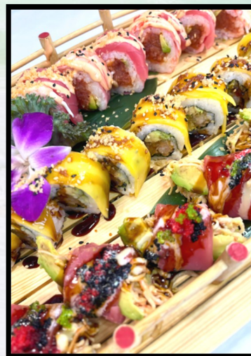
Mango's Top Trio

Our three most popular specialty sushi items beautifully presented for your enjoyment. OH SO GOOD, MARCO SUNSET ROLL MANGO TROPICAL ROLL. *no substitutions*