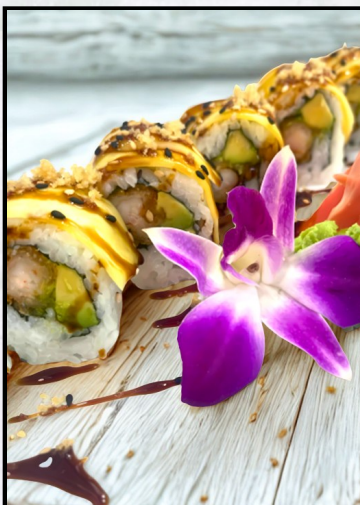
Mango Tropical Roll