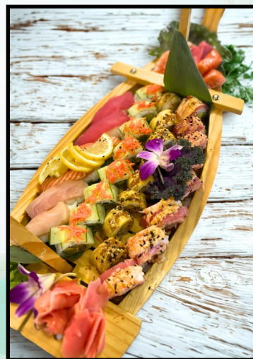
Sushi Boat For Two

Choice of 3 rolls, 8 pieces sashimi (2 yellowtail, 2 red tuna, 2 salmon, 1 octopus, 1 shrimp) and 6 pieces nigiri (2 yellowtail, 2 red tuna, 2 salmon). Choose 3 from the following: Marco Sunset Roll, California Roll, Shrimp Tempura Roll, Spicy Tuna Roll, Philly Roll, Firecracker Roll, Veggie Roll.