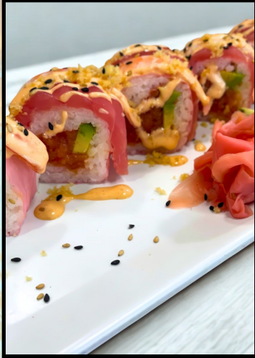
Marco Sunset Roll