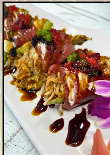
Oh So Good

Served in three crispy wontons with tuna, avocado, mango, onion, cucumber, kimchee, sesame oil and sweet chili sauce.