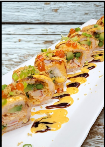
Crunchy Lobster Roll